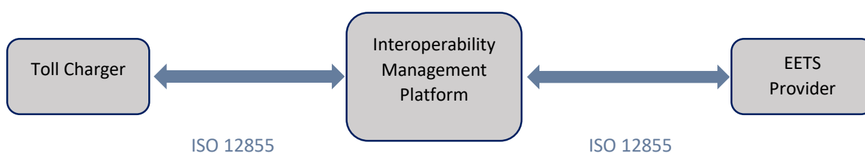
Figure 4: information exchange through IMP

The IMP allows, on a technical level, an EETS Provider to provide services to any Irish Toll Charger (TC), and hence, the back-office interface is between the EETS Provider and the IMP. The transactions with the toll chargers are all through the IMP, which acts as a 'clearing house' for all of the toll transactions.