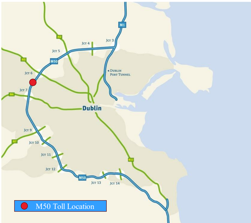
Figure 2: Location of M50

Tolls are charged for travel by non-exempt vehicles on the M50 between junctions 6 and 7 (see location on map below) in accordance with the Bye-Laws for the M50 (between Junctions 6 and 7) made pursuant to the Roads Act 1993 (as amended) (available here ) (“ M50 Bye-Laws ”).